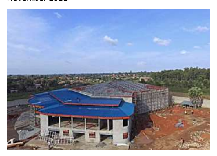
The Main Store