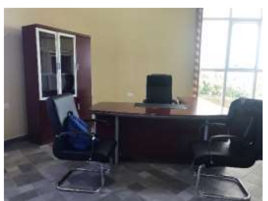
Also the majority of furniture has arrived