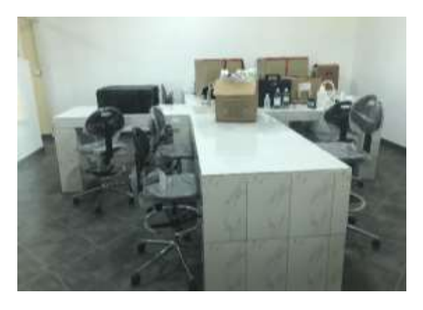
The first water samples tested