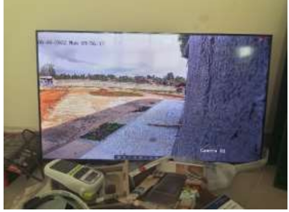
The laboratories are finished and work has started there